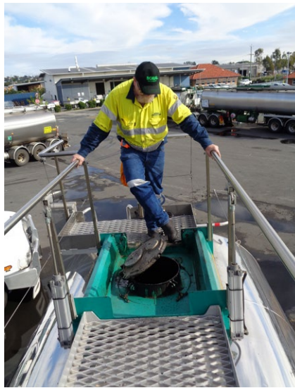
Figures 4 - 5: The ladders required climbing from the rear of the trailer, exposing operators and maintainers to potential points of release of bituminous product. They were weighty and requiring high initial and last steps to approach the top of the trailer. The guarding around hatches represented trip hazards and multiple hatches result in potential risk for heat dissipation. The side railing required manual operation.