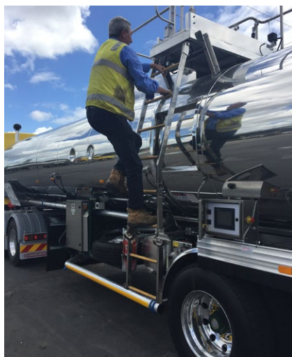
Figures 8 - 9: Analogue displays were changed to digital with information that could be conveyed centrally as well as on-equipment, and automated light-weight side ladders and railing helped reduce overall weight in transit, safe ingress/egress, and protection while working at heights. Top hatches were reduced in number (to one) and recessed to eliminate trip hazards and aid heat retention.