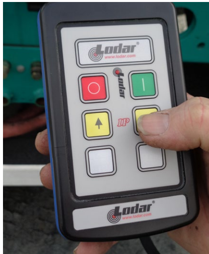
Figures 6 - 7: Remote control levers enabled the operators to discharge bitumen remotely, up to 100m, and isolate the worker from potential release points of hot and explosive product.