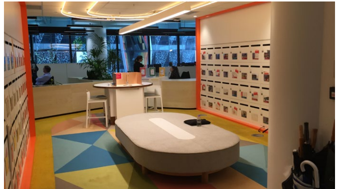
Images 2-5: vi Agile work-design at Medibank Private Docklands; webinar with Green Building Council of Australia and cited in Hedge & Pazell (2016).