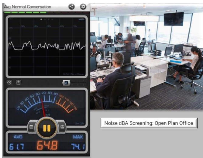
Investigation of worker complaint: The distractions of office noise

A referral request was received owing to complaint of office noise following a worker complaint of distractions in an open-plan office environment. Upon further investigation, the ergonomist advised an assessment of the individual and their sensory processing profile combined with gross environmental screening of noise, examination of other sensory stimuli within the work environment, productivity indices review, and analysis of job demands to inform strategies for work design and early intervention.